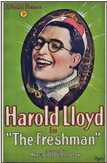
The Freshman

Grier famously starred as Jackie Brown, a flight attendant who becomes embroiled in a battle to smuggle money between the United States and Mexico. The 1997 crime film written and directed by Quentin Tarantino played to a sold out crowd at the Sie Theater. Grier's performance harkened back to the 1970s "blaxploitation" films she made famous in her early film career: Foxy Brown (1974) and Coffy (1973).