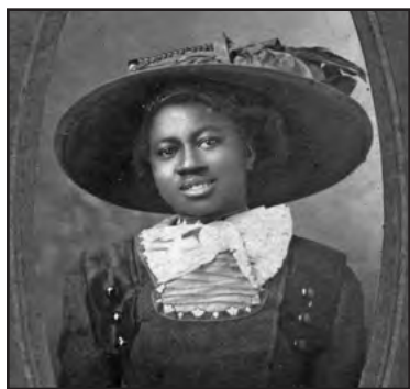
Hattie McDaniel as a teenager, circa 1910.