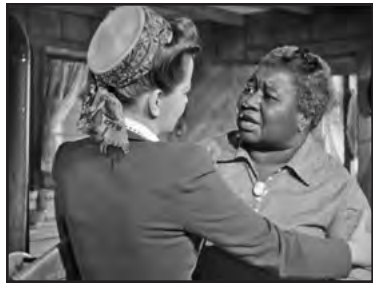
Olivia deHavilland and Hattie McDaniel "In This Our Life" 1942.