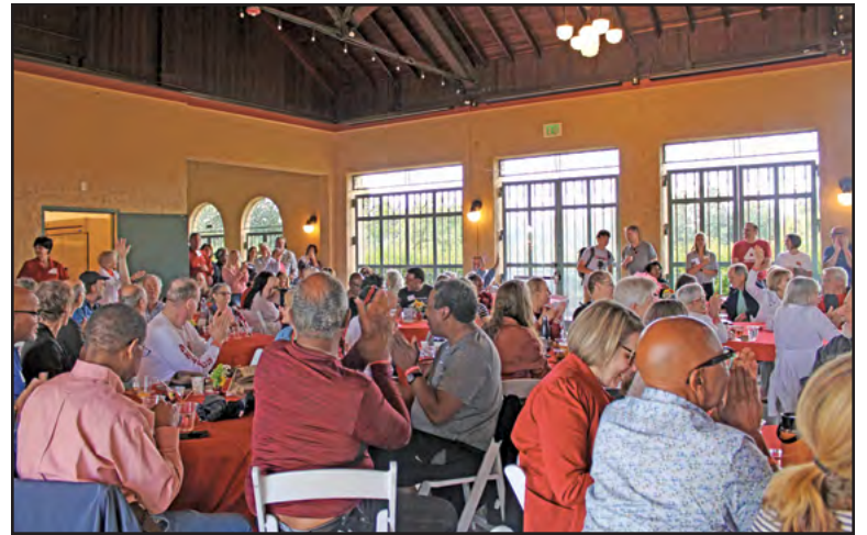
Principal's Breakfast at City Park Pavilion was well attended.

the whole East High community for the remarkable success of this entire Celebration. The celebration would not have happened without months of countless volunteer hours, the expertise of the 100/150 Planning Committee, and generous donations.