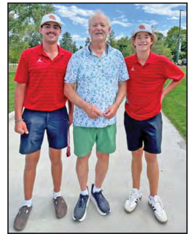
East Golf Team members with Bill Murray.