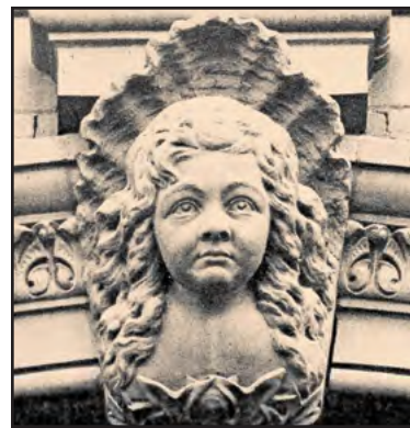
1890s – 1920s: "Old East High" 1898: East's first women's basketball team established.

Construction continues until 1889. The Keystone Angel at the grand entrance, prompts students to call themselves "Angels" thereafter. The "Angel" survives in the rock garden at "New East." A replica of the original "East Angel" created in 1964 is located on the second floor of the new school.