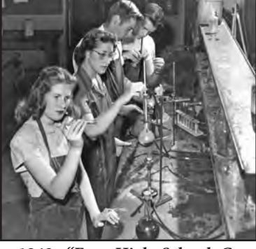
1948: "East High School General Education, Guidance, and Counseling Program" standardizes academic curriculum for incoming students.